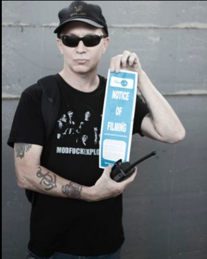
Bruce LaBruce on LAZ set , Aug 2009